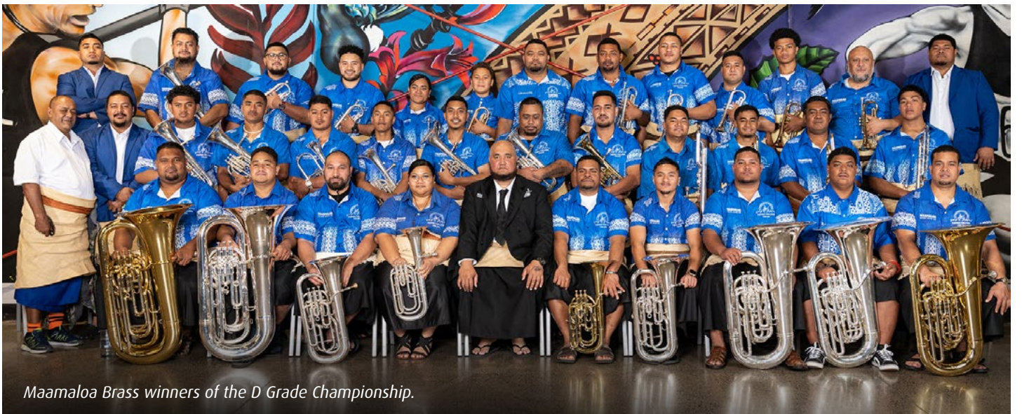
Maamaloa Brass winners of the D Grade Championship.