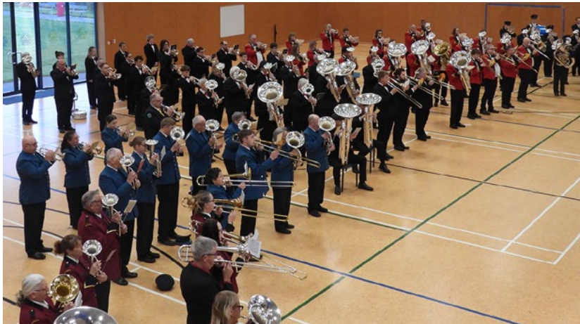
The Massed Bands event at the West Coast contest.