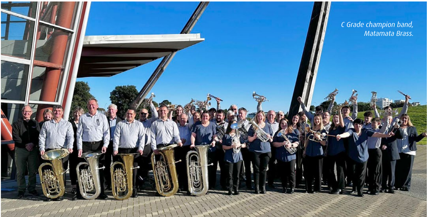
C Grade champion band, Matamata Brass.