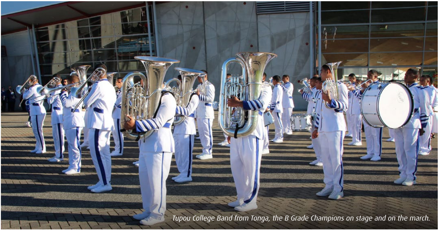
Tupou College Band from Tonga, the B Grade Champions on stage and on the march.