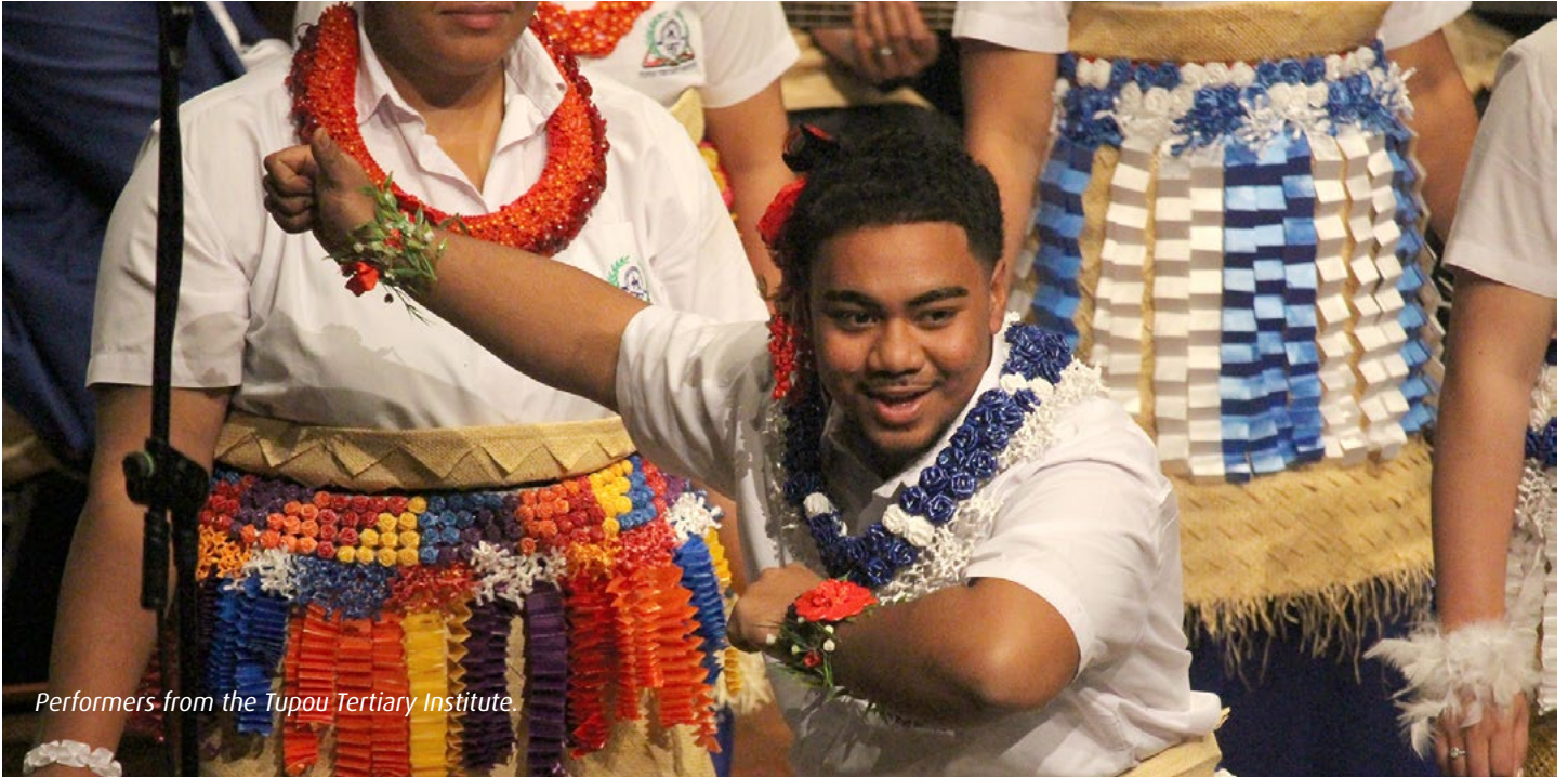
Performers from the Tupou Tertiary Institute.

New Zealand Mouthpiece is proudly sponsored by JP Musical Instruments | www.musicways.co.nz | 09 477 0384 | info@musicways.co.nz