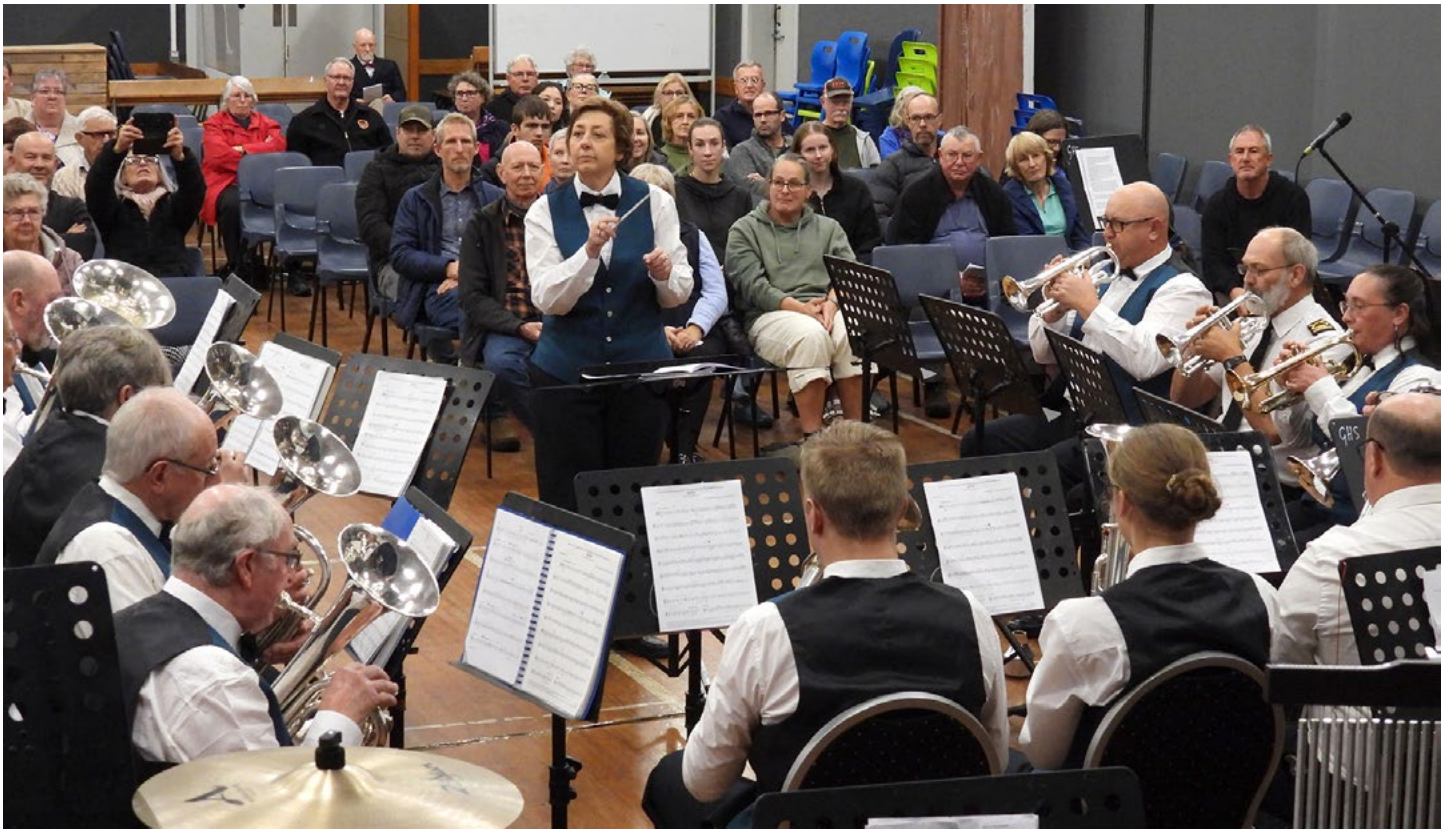
Greymouth Municipal Band performing at the West Coast contest for the first time in 11 years.