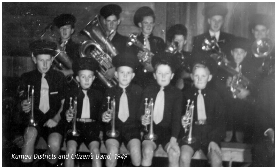
Kumeu Districts and Citizen's Band, 1949