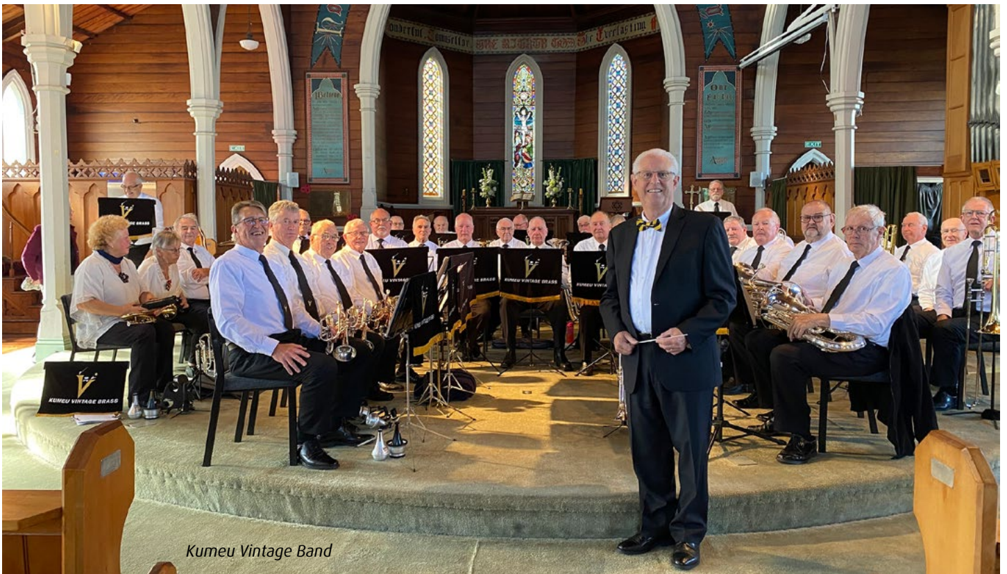
Kumeu Vintage Band