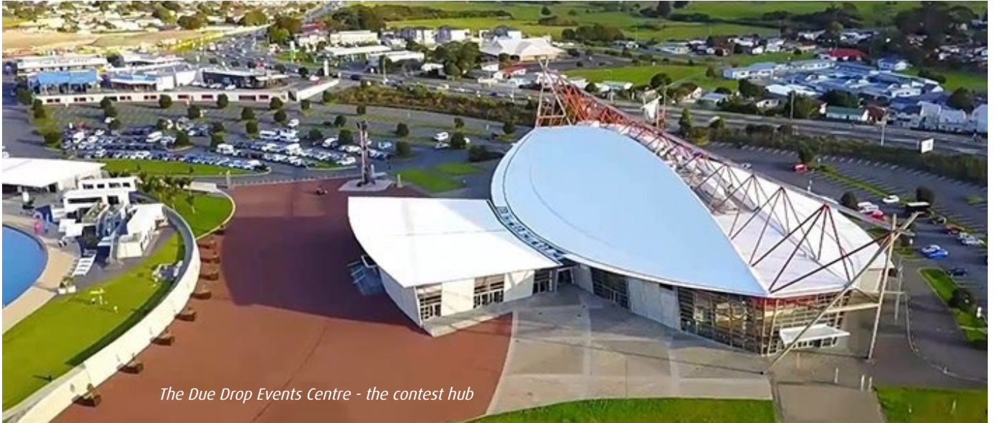
The Due Drop Events Centre - the contest hub

New Zealand Mouthpiece is proudly sponsored by JP Musical Instruments | www.musicways.co.nz | 09 477 0384 | info@musicways.co.nz