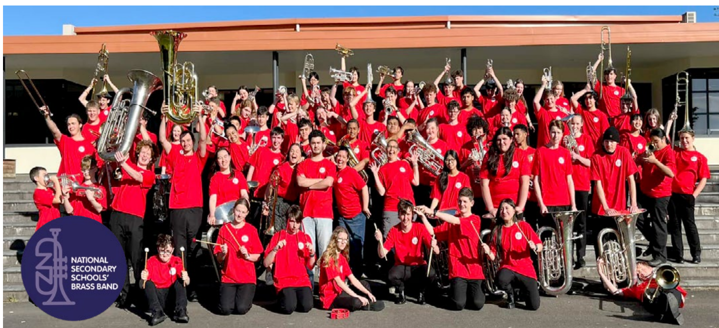
The 2023 National Secondary School bands.