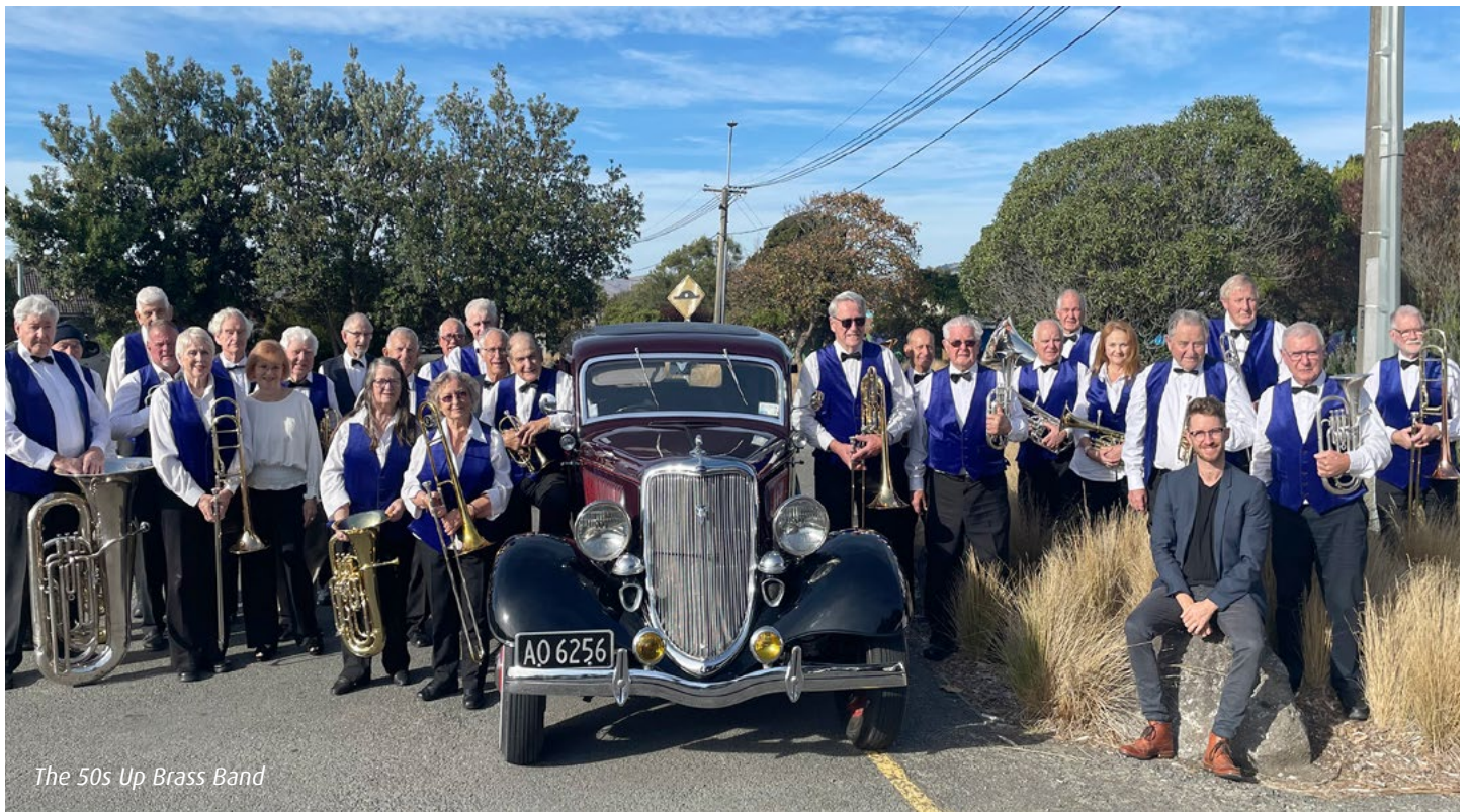
The 50s Up Brass Band