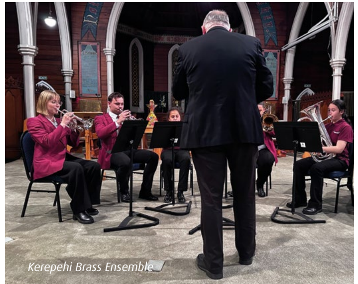
Kerepehi Brass Ensemble