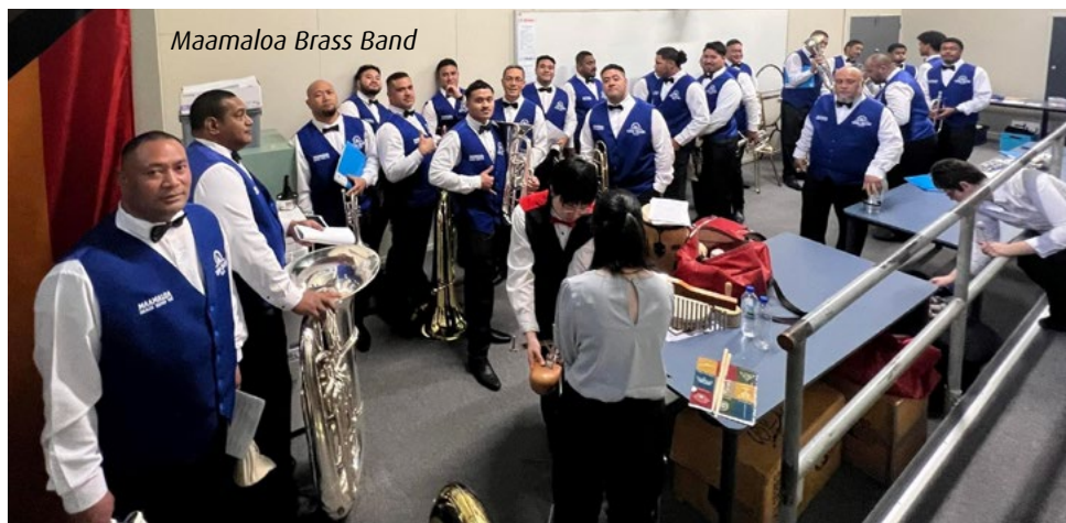
Maamaloa Brass Band