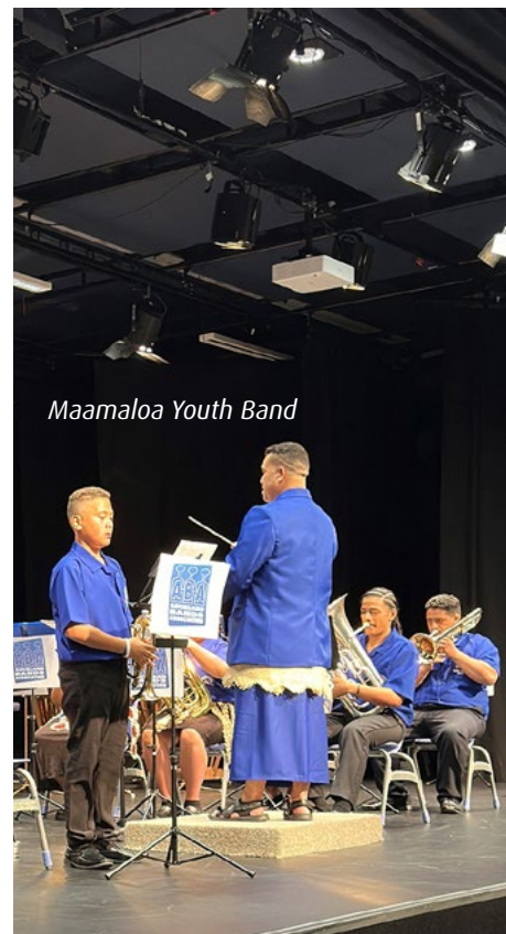
Maamaloa Youth Band